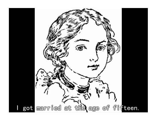
Figure 3: Digital Story "My Hope"

Even after bearing all the harsh experiences, her digital story still presents her wish to continue her married life by ignoring all pervious memories of the violent incidents faced at her in-laws house. Her story concludes on a happy note that as she has started to learn computer through this workshop therefore she is hopeful to continue her efforts to find happiness and satisfaction in her future life.