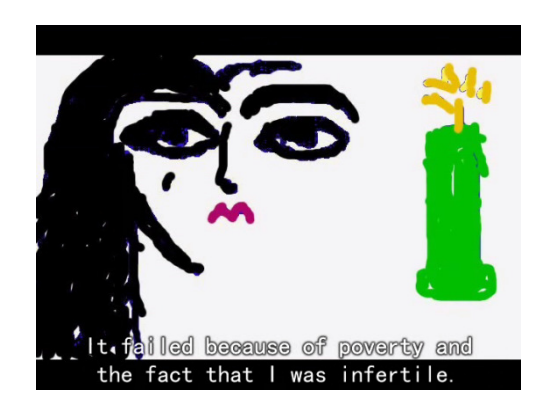
Figure 4: Digital Story "I Want to Raise My Voice against Oppression"

Through the digital storytelling workshop, the story creator was trained to use computer with the help of the facilitator as she was working on the computer for the first time. She also learnt internet browsing and email communication. Psychological pre-assessment showed that her confidence level was quite low initially. She had almost collected her complete self in a hard shell and would not want to talk about her sufferings. She believed that it was due to her bad luck that everything miserable had happened to her. She would often become nervous and feel anxious. She was also experiencing eating disorders. After completing this workshop, her post assessment showed that her confidence level had risen. She wanted to talk with others and her personality was more composed. She did not feel nervous and anxious anymore.