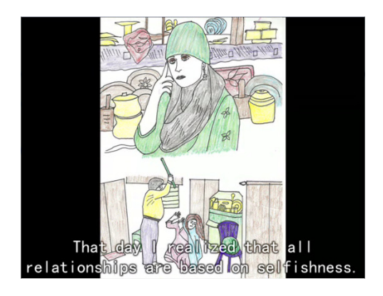
Figure 1: Digital Story "Was it My Ill-fate or Good Fortune?"

With hand drawn images, she aptly presents her life's incidents of domestic violence after marriage, in which she was economically and emotionally exploited by her husband for monetary gains as she was the earning hand. There she decided to divorce her husband and start afresh. Her family refused to stand by this decision and to accommodate her in her parent's house. At that point in time, she realized that the society and even family will continue to suppress her if she did not stand up to build her own career.