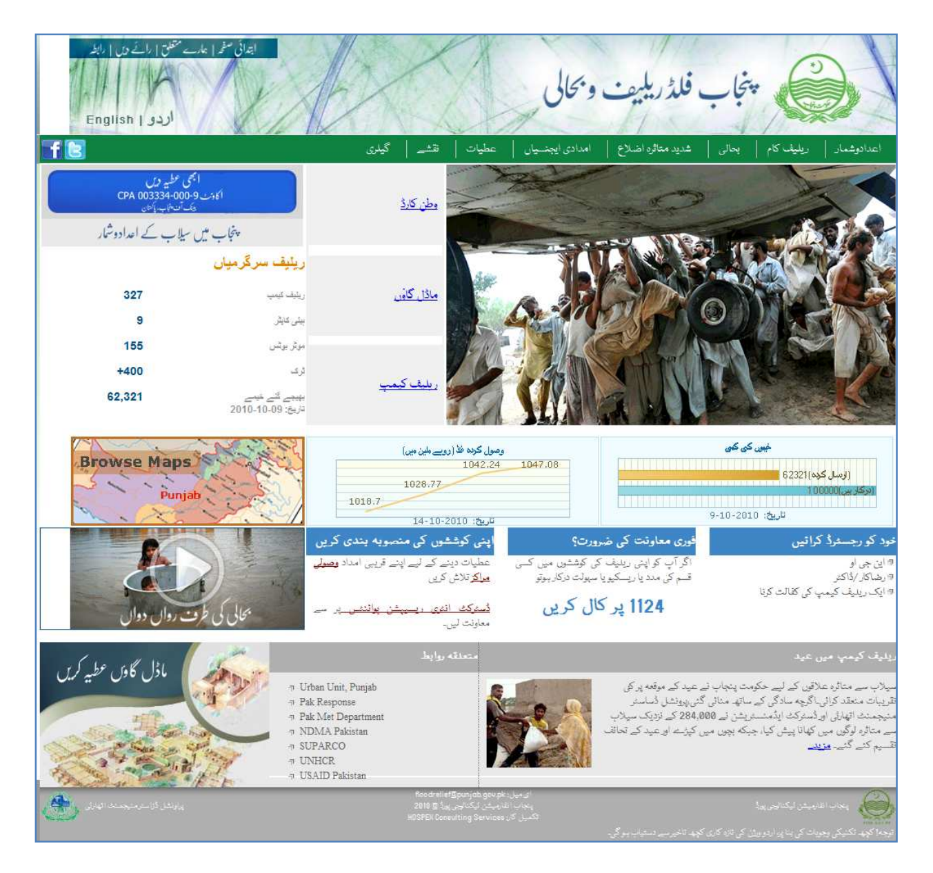
Figure 8. Punjab flood relief and rehabilitation website Urdu homepage

Figure 9 shows another page giving coverage of relief and rehabilitation information for district Dera Ghazi Khan. It can be seen that a wide array of information has been presented using multiple tabs starting at the bottom half of the page. In the screen capture, the NGO section has been opened for viewing.