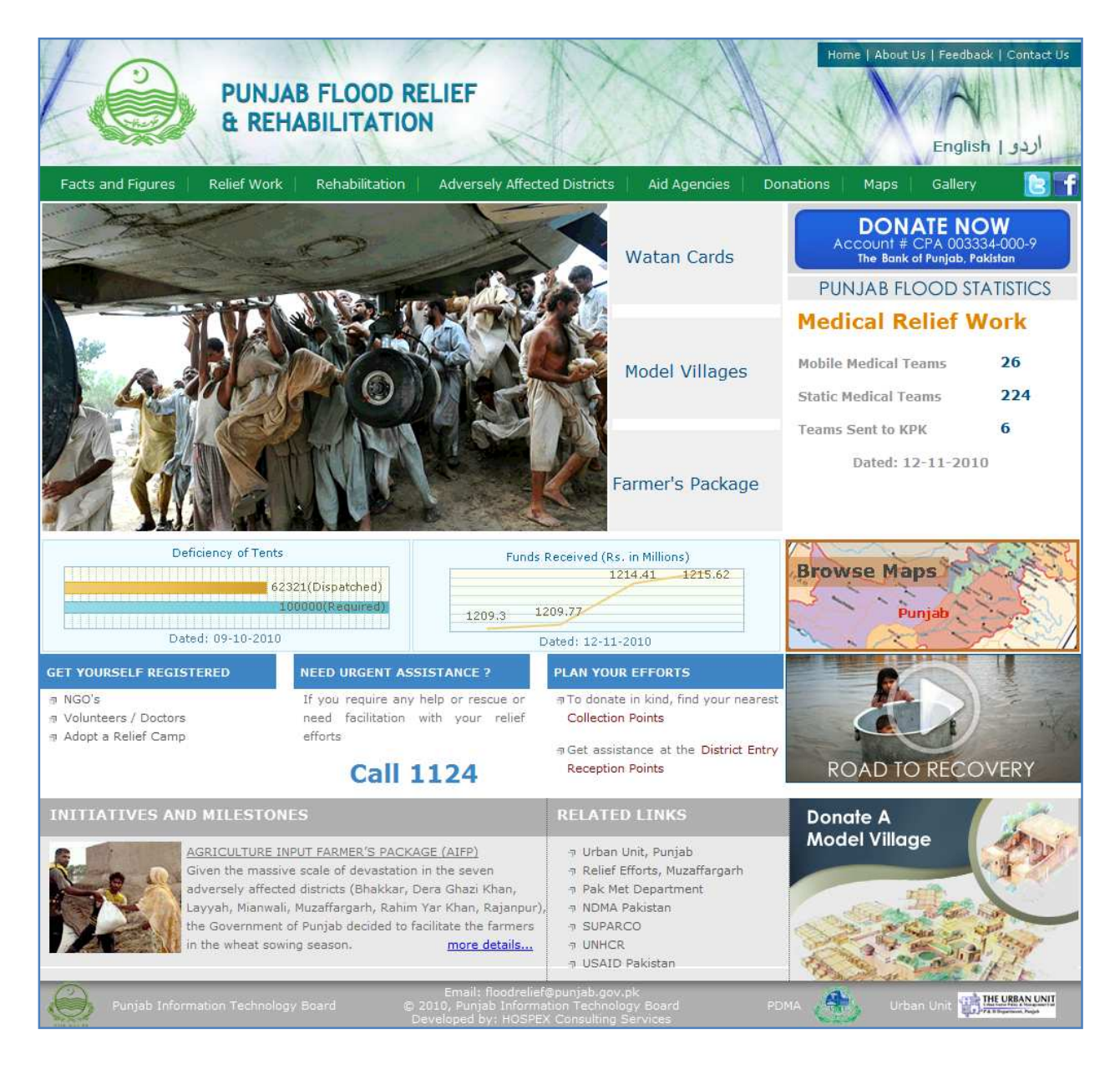
Figure 1. Punjab flood relief and rehabilitation website homepage

deluge. This was then improved through a succession of currently ongoing rapid increments. These developments included the addition of new information and deployment of a parallel version in Urdu language. Figure 1 shows a screen capture of the website homepage taken in mid November 2010.